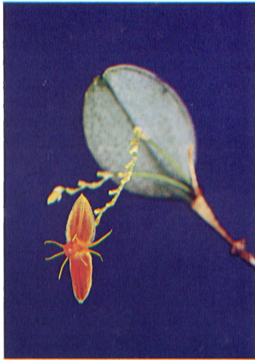
125. LEPANTHES OCTOPUS Luer & R. Escobar

125. LEPANTHES OCTOPUS Luer & R. Escobar, sp. nov.