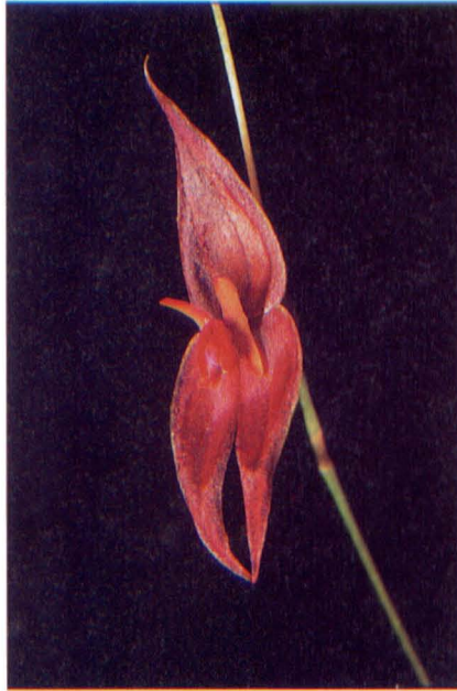
Lepanthes pabloi Luer & Behar