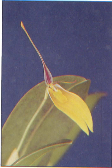
R. jesupiana Luer.