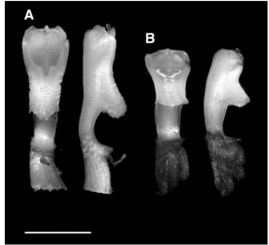
FIGURE 3. Comparison of the column of: A — Elleanthus cynarocephalus (Dressler 6697). B — E. carinatus (Dressler 7069). Scale bar = 5 mm.

E. carinatus than in E. cynarocephalus (Fig. 3). A striking difference in the available material is that the flowers of E. carinatus open from the base of the head upwards (Fig. 8A), while those of E. cynarocephalus open from the apex downward.